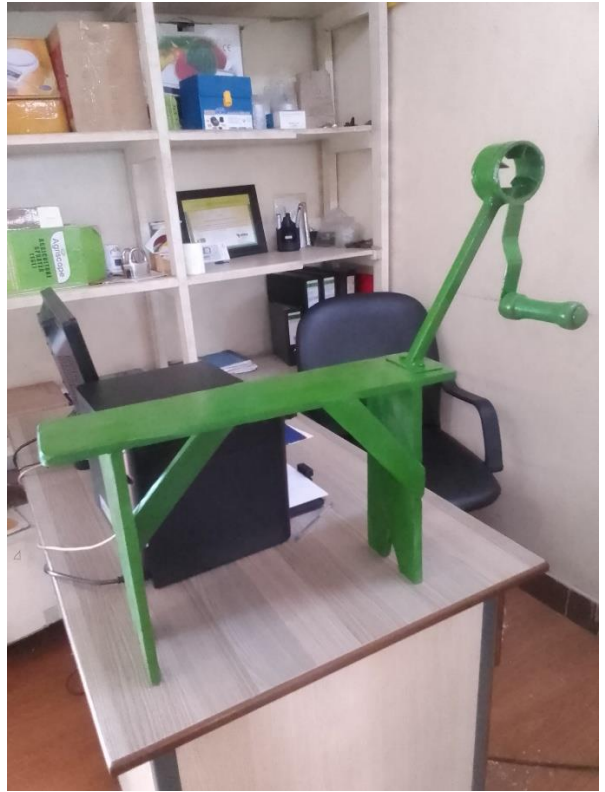
Hand maize sheller (Akamashini gahungura ibigori)